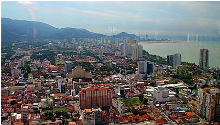
Penang, The Vibrant Island