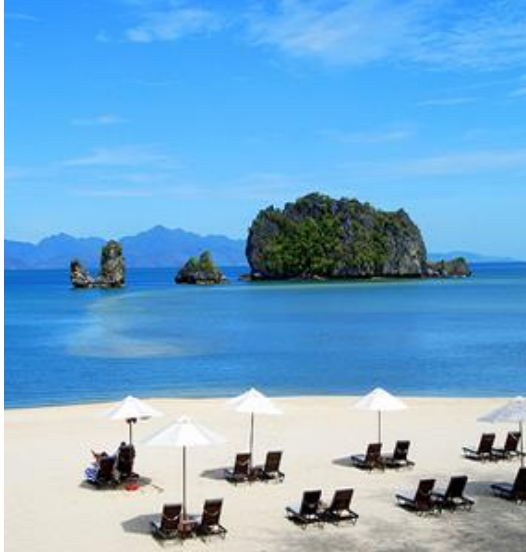
Langkawi stretched beaches