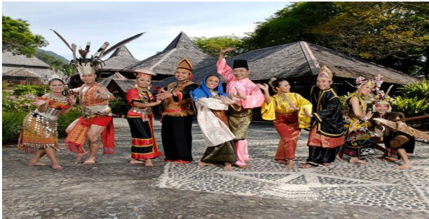
Sarawak's cultural village