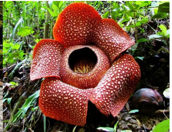
Rafflesia, the biggest flower in the world