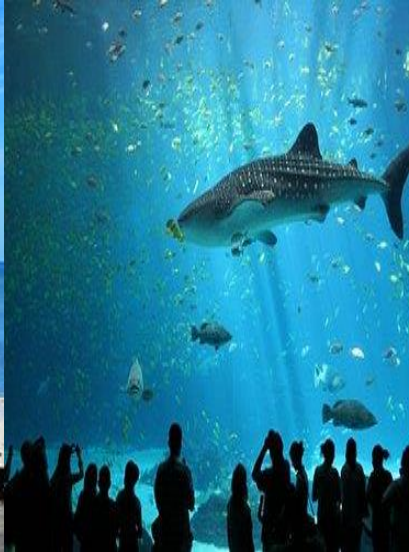
Underwater World Langkawi