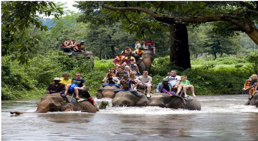
Aventure trip in Bali