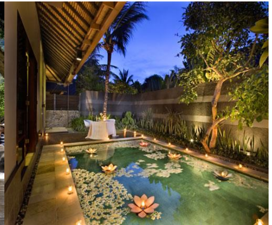
Romantic setting at luxury Resort