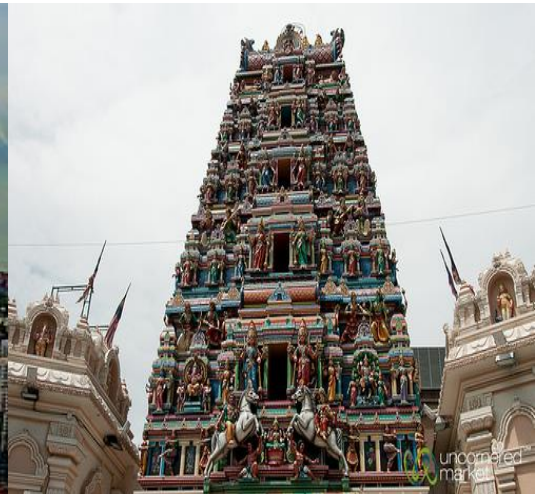
Temple in Georgetown